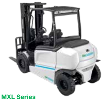
Pneumatic Tire Models

Load Capacity (lbs): 5,000 / 6,000 / 7,000