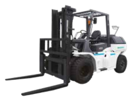
PD6 Series Pneumatic Tire Models