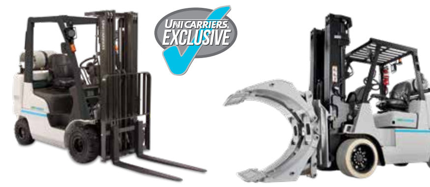
Platinum II® Nomad Series Compact Pneumatic Tire Models

Load Capacity (lbs): 3,000 / 3,500 / 4,000<sup>†</sup> 5,000 / 5,500 / 6,000<sup>†</sup> / 6,500<sup>†</sup> / 7,000 / 8,000