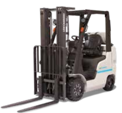
Platinum II® Series Cushion Tire Models

Load Capacity (lbs): 3,000 / 3,500 / 4,000<sup>†</sup> / 5,000 5,500 / 6,000 / 7,000