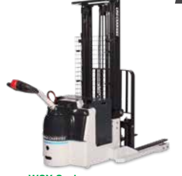
WSX Series Walkie Straddle Stackers 24V