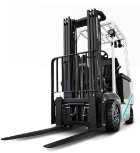
BX Series Cushion Tire Models 36V / 48V

Load Capacity (lbs): 3,000 / 3,500 / 4,000* 5,000*/6,000/6,500/8,000