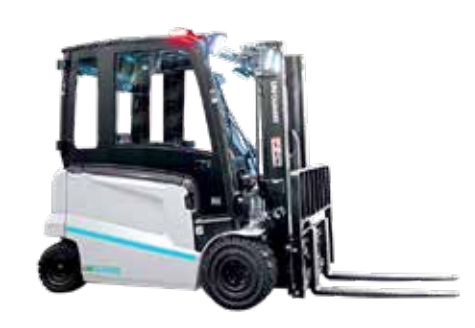
MX2 Series Pneumatic Tire Models

Load Capacity (lbs): 3,000 / 3,500 / 4,000