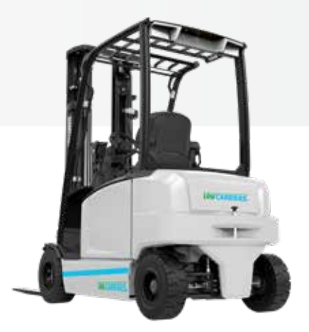
MXS - 4 Wheel Series Solid Pheumatic Models

Load Capacity (lbs): 2,700 / 3,000 / 3,500 / 4,000