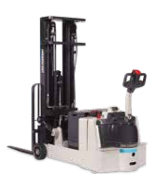
WCX Series Walkie Counterbalance Stackers

Economy, versatility and performance — they're all standard on UniCarriers battery powered forklifts.