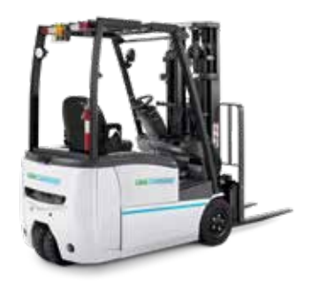
TX-M 3-Wheel Series Cushion Tire Models 36V / 48V

Load Capacity (lbs): 3,000 / 3,500 / 4,000