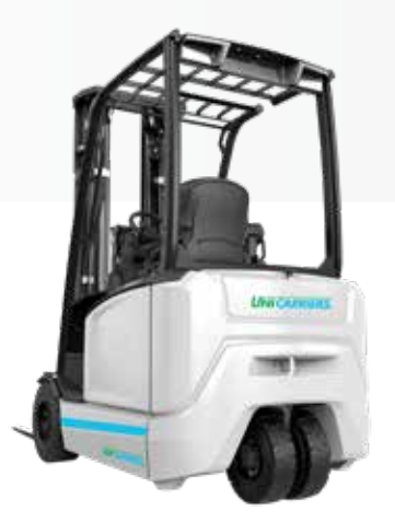
MXST - 3 Wheel Series Solid Pheumatic Models

Load Capacity (lbs): 3,000 / 3,500 / 4,000* 5,000*/6,000/6,500/8,000