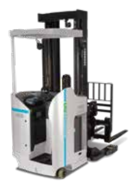
SRX Series Reach Truck Models

Load Capacity (lbs): 9,000 / 10,000 / 11,000 / 12,000