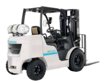
PF(D)80-PF(D)120 Series Pneumatic Tire Models

Load Capacity (lbs): 4,000 / 5,000 / 6,000 / 7,000