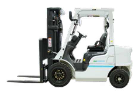
PD Series Pneumatic Tire Models